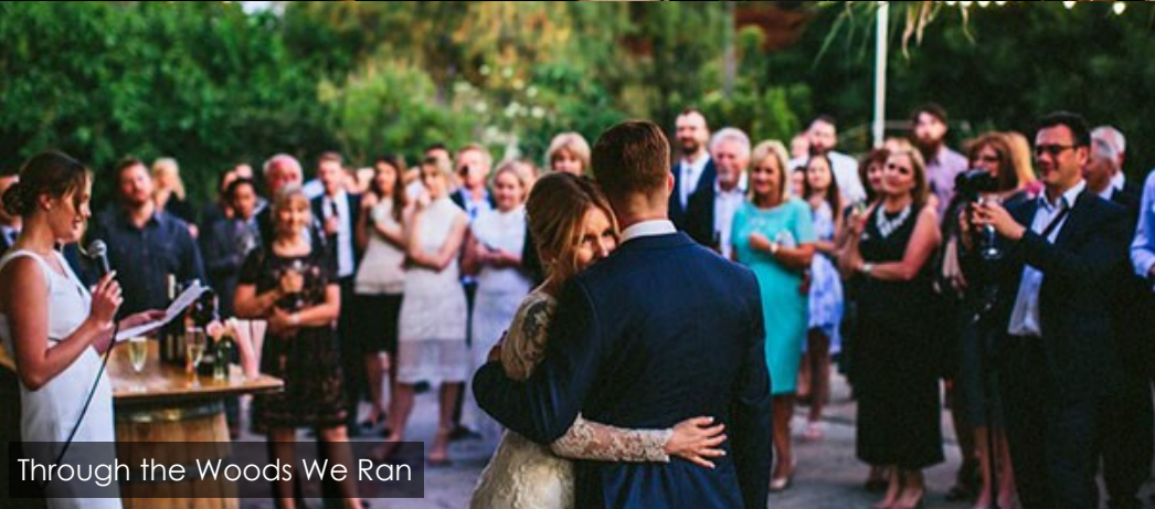
Through the Woods We Ran