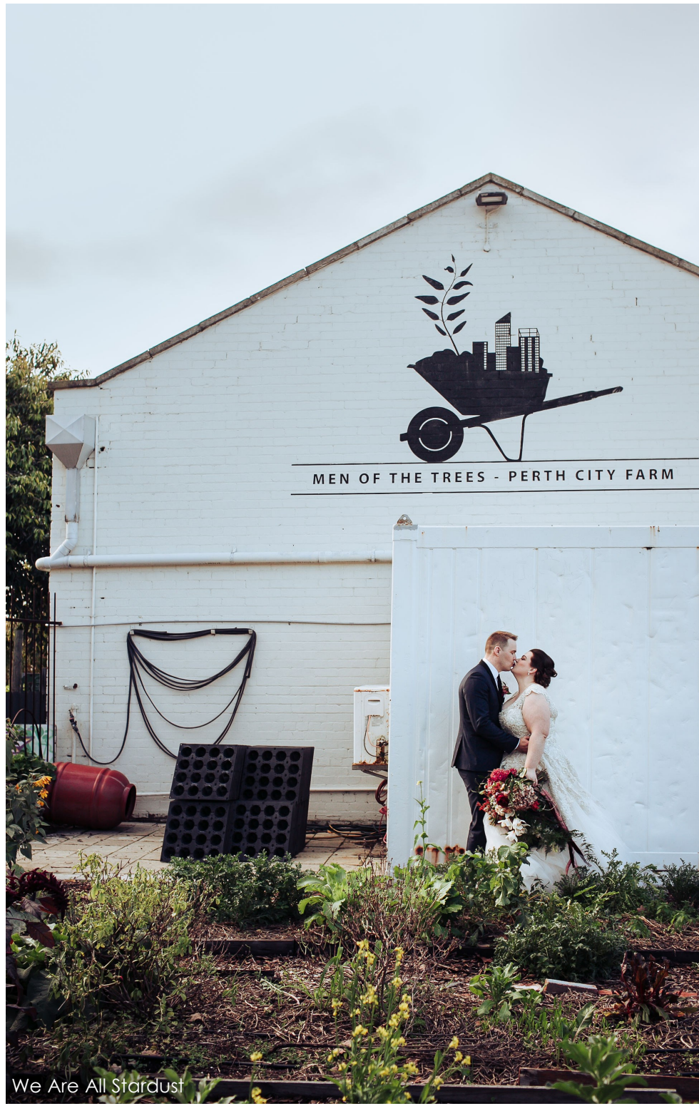
We Are All Stardust