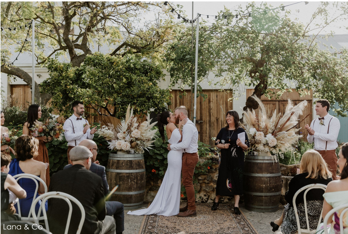
Lana & Co